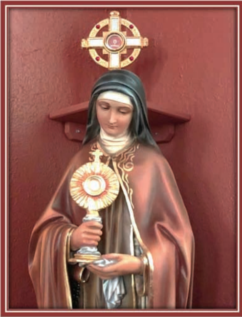
Fifth Sunday in Ordinary Time February 4, 2024