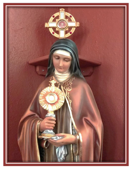
Fifth Sunday of Lent March 17, 2024