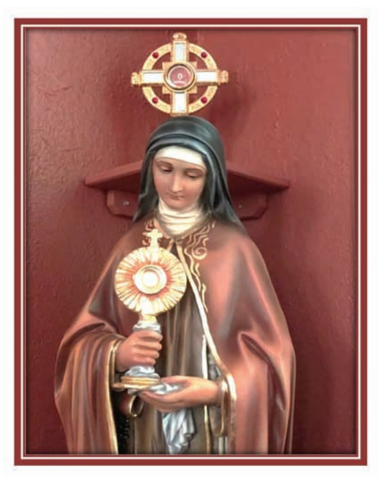
Second Sunday in Ordinary Time January 14, 2024